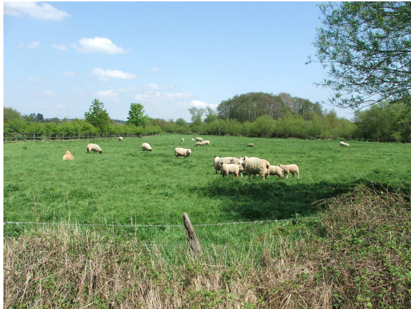
Fields in environmental stewardship at Flitton Moor.

This Biodiversity Character Area consists of the Greensand River Valleys, incorporating the Flit (7A) and the Ouzel (7B) – two of the Landscape Character Types described in the Bedfordshire Landscape Character Assessment.