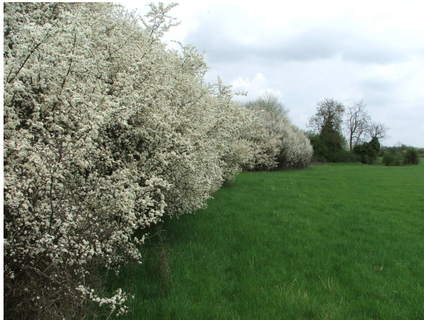
Houghton Conquest meadow with hedgerows.