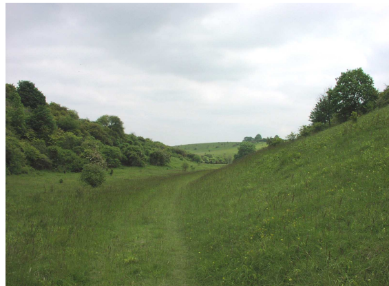
Pegsdon Hills.

This Biodiversity Character Area consists of the Chalk Escarpments (9); the Rolling Chalk Farmland, Totternhoe – Dunstable Downs (10A); and small parts of the Rolling Chalk Farmland, Houghton Regis North Luton (10B) and the Rolling Chalk farmland, Barton Hill – Butterfield Green (10C) - four of the Landscape Character Types described in the Bedfordshire Landscape Character Assessment.