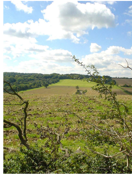
Chalk dipslope north of Studham.