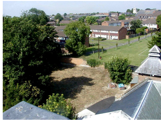
Houghton Regis.

The underlying geology is Lower and Middle Chalk on the lower lying land with Upper Chalk on the higher land to the south and east, mostly overlain by Clay with Flints. Valley Gravels overlie the chalk in the Lea Valley that runs through Luton.