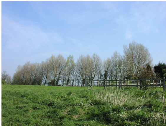
Native black poplar ( Populus nigral ssp. Betu folia ) near Gravenhurst.