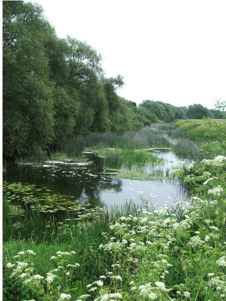
The River Great Ouse at Sharnbrook.