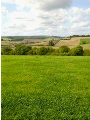
The Gade valley, south of Studham.

This Biodiversity Character Area consists of the Gade (12A) and Lea (12D) of the Arterial Chalk River Valleys (12) - one of the Landscape Character Types described in the Bedfordshire Landscape Character Assessment.