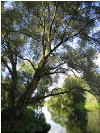
The River Great Ouse near St Neots.