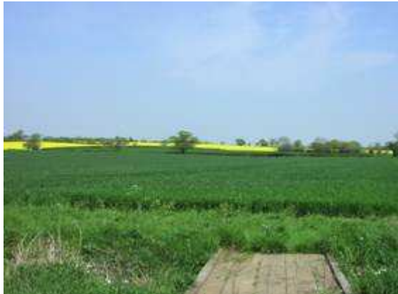
Arable fields near Upper Dean.

This Biodiversity Character Area consists of the Arable Clay Plateaux with Tributaries (1) and most of the Wooded Wolds (2) – two of the Landscape Character Types described in the Bedfordshire Landscape Character Assessment.