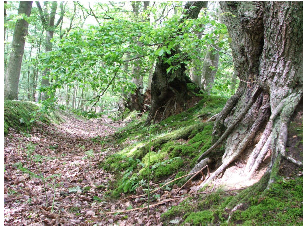
Bakers Wood Site of Special Scientific Interest.

The underlying geology is Lower Greensand with some Oxford Clay, Gault Clay, Ampthill Clay and Kimmeridge Clay, and is frequently overlain with Boulder Clay and occasional Glacial Gravels. Small deposits of peat have also been laid down in places, mainly in the base of the small valley that runs through the Heath and Reach area in the southwest.