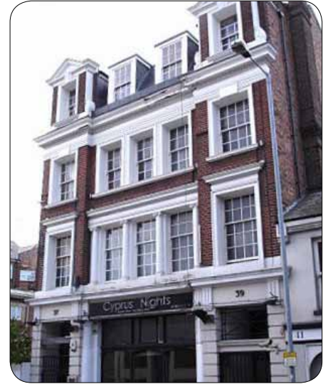
15 On the opposite side of Guildford Street, nos. 37-39 are a striking 'neo-classical' design with pedimented dormer windows instead of the more usual parapet, built about 1912 as a warehouse and factory for Austin and Co. By 1947 it had become a clothing factory and was later divided up internally, leaving little of the original features ( above ).