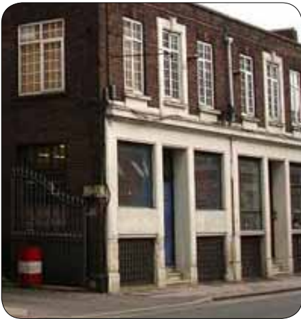
13 An example of the 'neo-Georgian' style that was current in the early 1930s can be seen at 22 a&b Guildford Street ( above ). Designed by B.B. Franklin in 1931, this is a small symmetrical pair of premises built over the basement of an earlier warehouse. The commercial function is seen from the treatment of the ground floors: each property has a central doorway, reached via steps spanning the basement and flanked by two display windows. There was basement storage and a ground-floor plait shop with offices, and a first-floor showroom running the width of both properties.