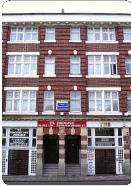
14 23-27 Guildford Street is another ex-hat factory ( now flats and businesses ), dating from the early years of this century, this time in Luton grey brick with a striking symmetrical design arranged over four floors ( above ).