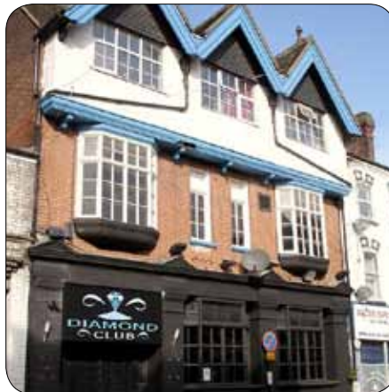
17 53 Cheapside, lately the Diamond nightclub, was built in 1882 as The Cowper Arms, a 'temperance tavern' ( coffee shop ) run by the Beds Coffee Co., and is a grade II listed building ( above ). A pleasing design with its triple gables, jettied second floor and oriel windows on the first floor, it was occupied by straw hat manufacturers in the early 20th century.

The name Cheapside comes from an old Saxon word meaning market. Like Bute Street, before the Arndale Centre ( now The Mall ) was developed, the road ran through to George Street.