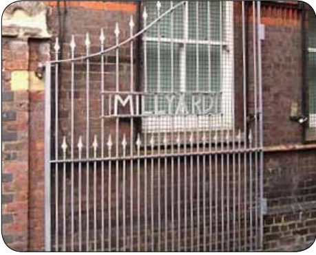
12 The Millyard gates alongside 24 Guildford Street are a reminder that other trades existed in the area ( above ).