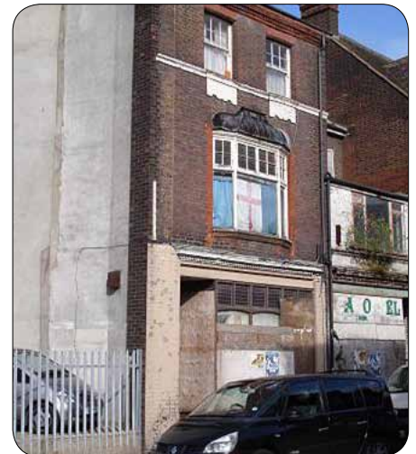
18 49 Cheapside is the only one remaining of a row of buildings in the same style which used to extend south towards Silver Street ( above ). Its first and second floor windows and well detailed, ground floor shopfront are key features. Built circa 1900, it was used as a hat factory/warehouse.