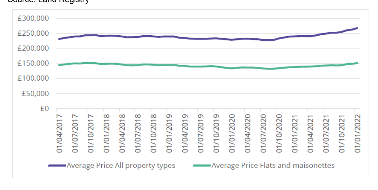
Figure 1 average price paid, Luton Borough<sup>40</sup>

Flats achieved a less significant uplift in value over the same period with growth from an average achieved value of £144,726 in April 2017 to £151,357 in April 2022. This reflects a 4 per cent uplift in value. <sup>39</sup>