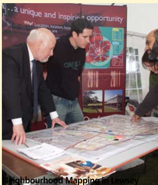
Neighbourhood Mapping in Lewsey

This shows that local people want to work together with the Council, Police, Health services, Fire and Rescue Service as well as community and voluntary groups to improve life in Lewsey.